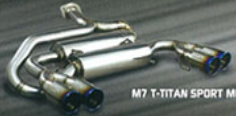
M7 T-TITAN SPORT MUFFLER