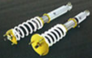
M7 SUPER STREET PERFORMANCE DAMPER