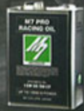
M7 PRO RACING OIL 1000HP