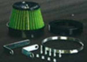
M7 SUPER POWER FLOW FILTER ADAPTER TYPE