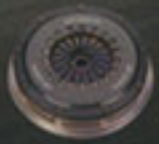
M7 SUPER SINGLE CLUTCH DCS, FD2, CL7 M7 SUPER TWIN CLUTCH GDB & GRB, CN9A, CP9A, CT9A