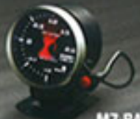
M7 RACING METER SMD [BOOST METER, EX TEMP. METER, TEMP. METER, PRESS METER]