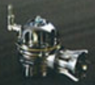
M7 HYPER SOUND BLOW OFF VALVE TYPE GT-7 UNIVERSAL