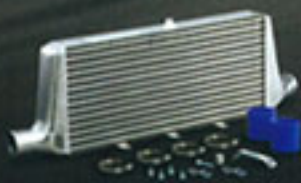
M7 COMPETITION TYPE R INTERCOOLER KIT