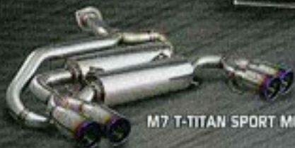
M7 T-TITAN SPORT MUFFLER