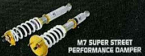
M7 SUPER STREET PERFORMANCE DAMPER