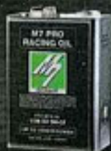
M7 PRO RACING OIL 1000HP