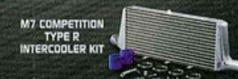
M7 COMPETITION TYPE R INTERCOOLER KIT