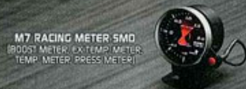
M7 RACING METER 5MD (BOOST METER, EXTEMP METER, TEMP METER, PRESS METER)