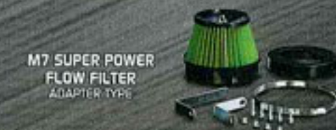
M7 SUPER POWER FLOW FILTER ADAPTER TYPE