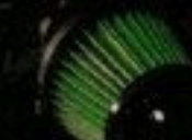
M7 SUPER POWER FLOW FILTER ADAPTER TYPE