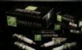
M7 TUNED UP PLATINUM PLUG