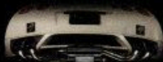
M7 T-TITAN SPORTS MUFFLER