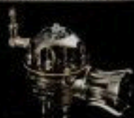
M7 HYPER SOUND BLOW OFF VALVE TYPE GT-7