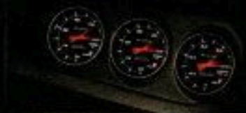
M7 RACING METER SMD BOOST METER, EX TEMP METER, TEMP METER, PRESS METER