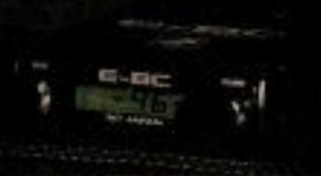
M7 E-BC ELECTRONIC BOOST CONTROLLER