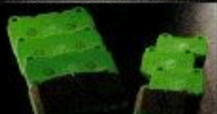
M7 SUPER COMPETITION CERAMIC BRAKE PAD 700*