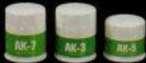
M7 GT PERFORMANCE OIL FILTER MAGNET TYPE