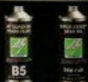
M7 SUPER B5 BRAKE FLUID M7 SUPER STREET GEAR OIL