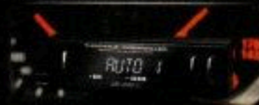
M7 THROTTLE CONTROLLER AUTO PRO-R