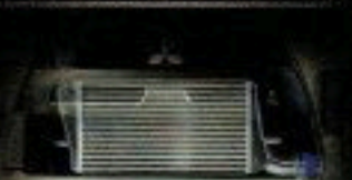
M7 COMPETITION TYPE R INTERCOOLER KIT