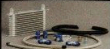
M7 COMPETITION TYPE R OIL/ATF COOLER KIT