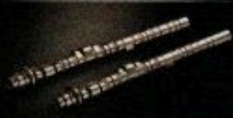
M7 SUPER STREET CAMSHAFT FD2, DC5