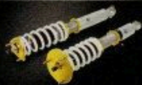
M7 SUPER STREET PERFORMANCE DAMPER