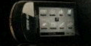
M7 TOUCH R.A.C.E REFLASH AND COMPLETE ELECTRONIC