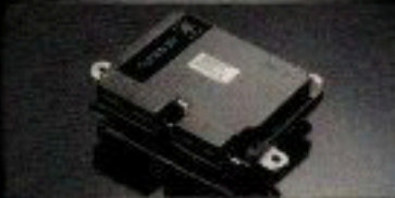
M7 ROM ENGINE CONTROL UNIT GTR R35, GRB & GRF, CZ4A, R38