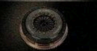
M7 SUPER SINGLE CLUTCH DC5, FD2, CL7 M7 SUPER TWIN CLUTCH GDB & GRB, CN5A, CP5A, CT5A